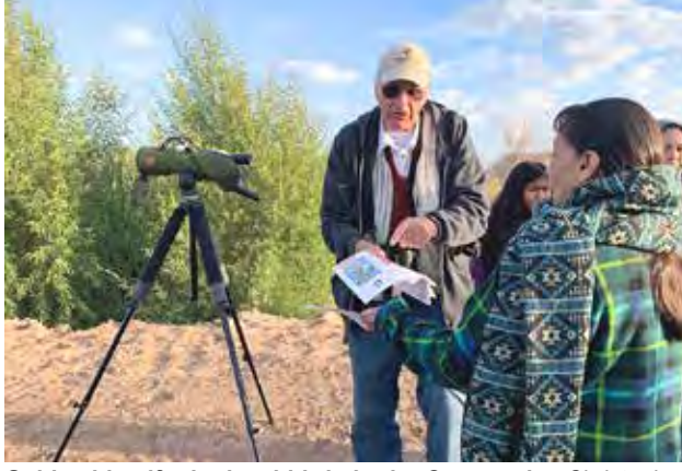
Guides identify the local birds in the Community.