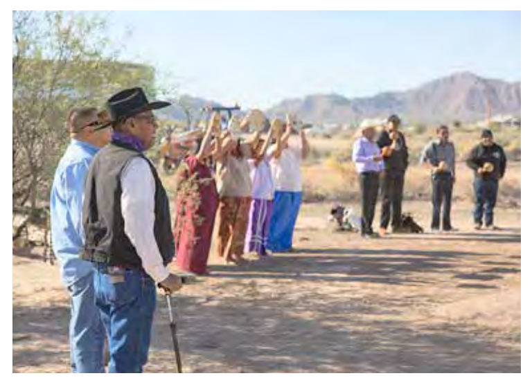
A crowd welcomes the arrival of a Huhugam petroglyph boulder returned to the Community.