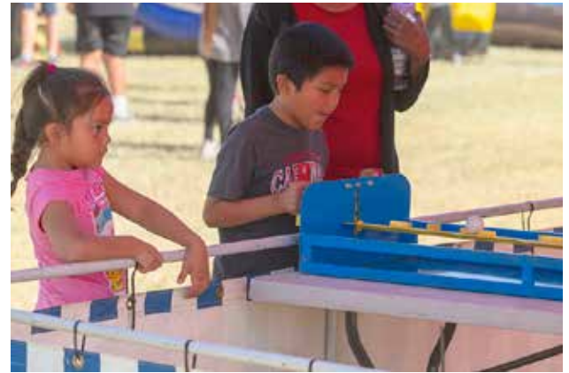
The event featured carnival style games, raffle drawings and live entertainment.

"We wanted to do something that involved the