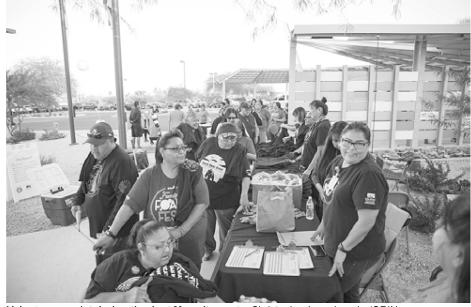
Volunteers assist during the Just Move It events.

Diabetes Prevention consists of five staff members and we could not coordinate this huge event without several volunteers from the Life Center staff as well as volunteers from the Gila River Indian Community Genesis Program. Gila Relations department did a great job designing out