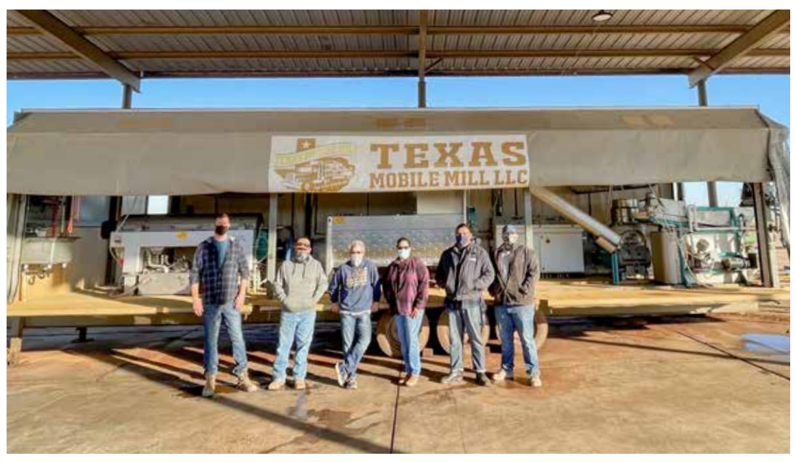
Gila River Farms staff, workers and Lone Star Olive Ranch harvesters stand in front of the large mobile olive mill

"We have a lot of individuals already who are interested in buying the oil and even the fruit. but we are looking ... down the line to have our own equipment to process the oil," said Sauceda-