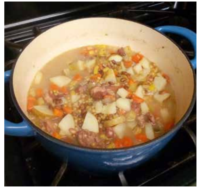
A Poshol dish, during the AOPPYC cooking presentation on Dec. 29.

Virtual activities like this represent a way to have fun while staying home, Preston, allowing young GRIC members to have positive interactions maintaining the Community's stay-at-home every time we do an activity. we have a survey that will ask