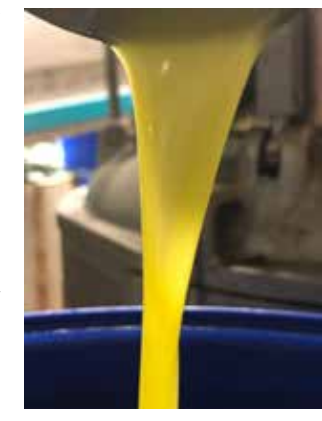
Processed olive oil flows into a storage container after going through an extensive refinement at a mobile mill.

To learn more about Gila River Farms, go to https://gilariverfarmssales. com/ today.