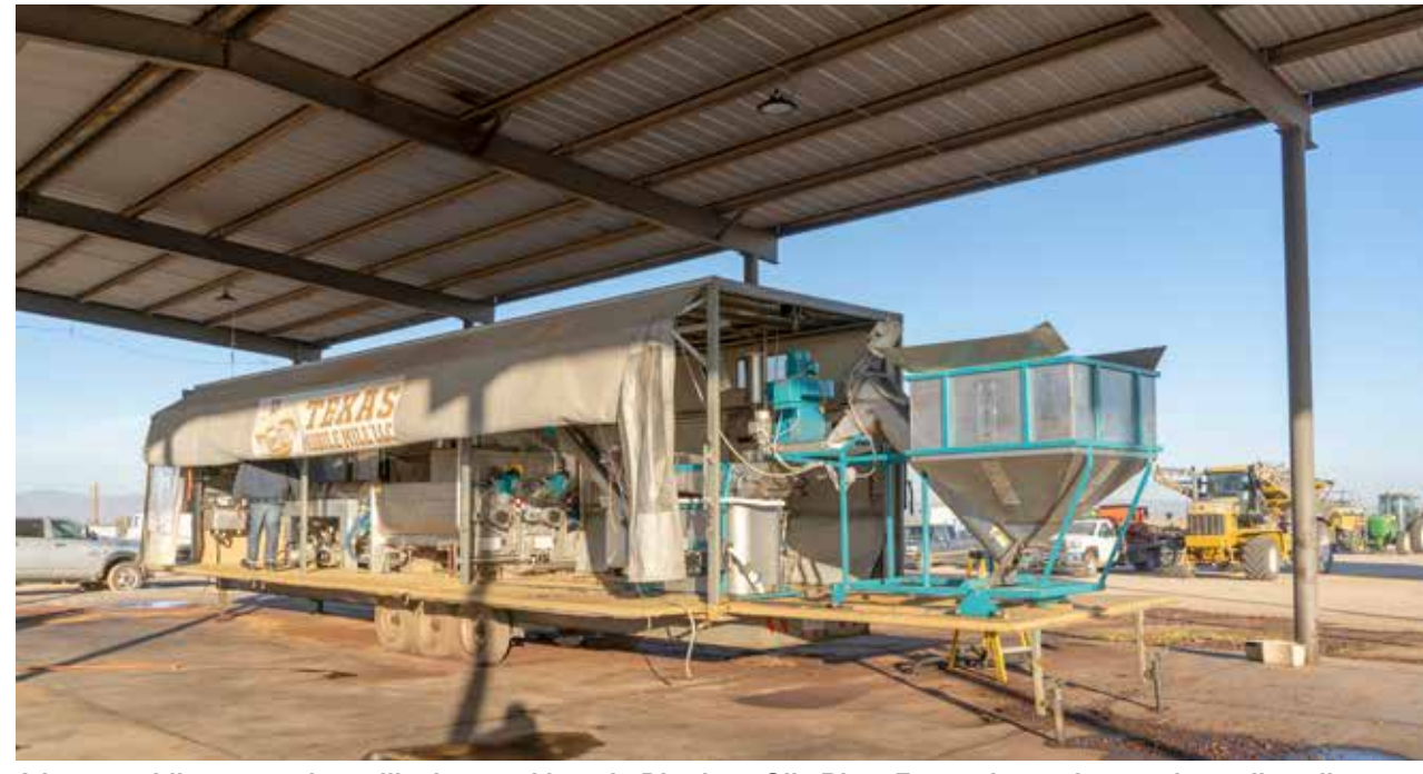
A large mobile processing mill, picutured here in District 5 Gila River Farms, is used to produce olive oil.