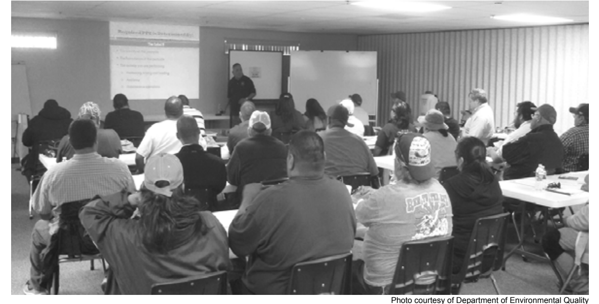
Community members and employees learn about the new Pesticide Code at a pesticide applicator course run by the Pesticide Control Office.

The Pesticide Control Office looks forward to continuing to offering this certification course to raise awareness of pesticides and pesticide safety, while ensuring