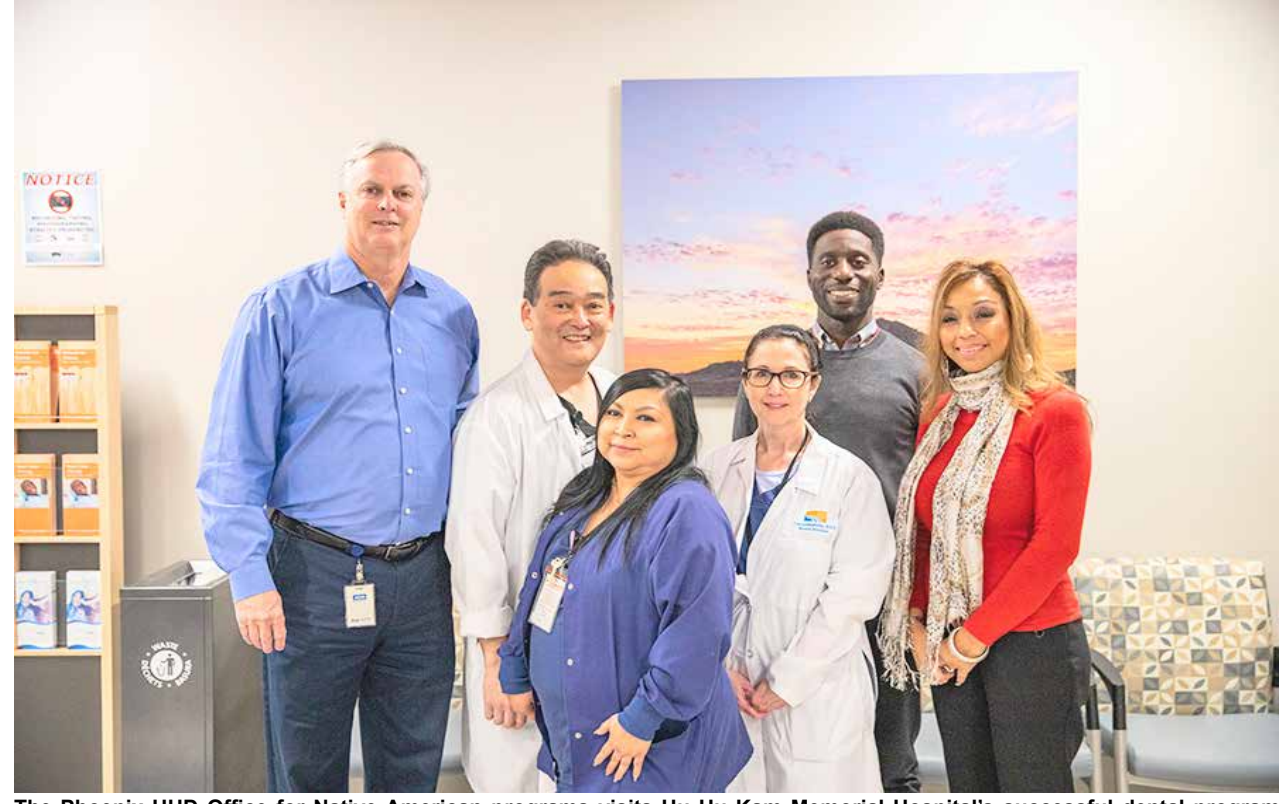
The Phoenix HUD Office for Native American programs visits Hu Hu Kam Memorial Hospital's successful dental program.

fer privacy and are more spacious. "The dental chairs and equipment are new," said Herschenhorn. The renovation of approximately 8,750-square-feet showcases ten private individual dental exam and procedure rooms, of which two are Americans with Disabilities Act compliant and four pediatric exam rooms. The space increase created a much larger patient waiting area, private patient consultation room, and a centralized medical gas system eliminating portable tanks and hoses.