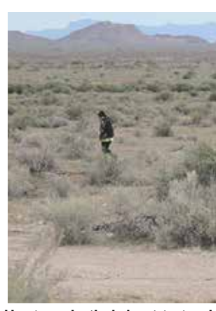
rabbits on Dec. 31, 2019.

building where they prepare the rabbit into a stew for the District's New Year celebration.