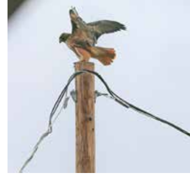
Annual bird count monitors birds that inhabit the Gila River Indian Community like Red Tail Hawks.

The event starts at 7 a.m. at various staging areas to meet and receive "assignments." Those staging areas are at District 5 Casa Blanca Chevron Station, District 6 Komatke Chevron Station, and the District 7 Service Center. From