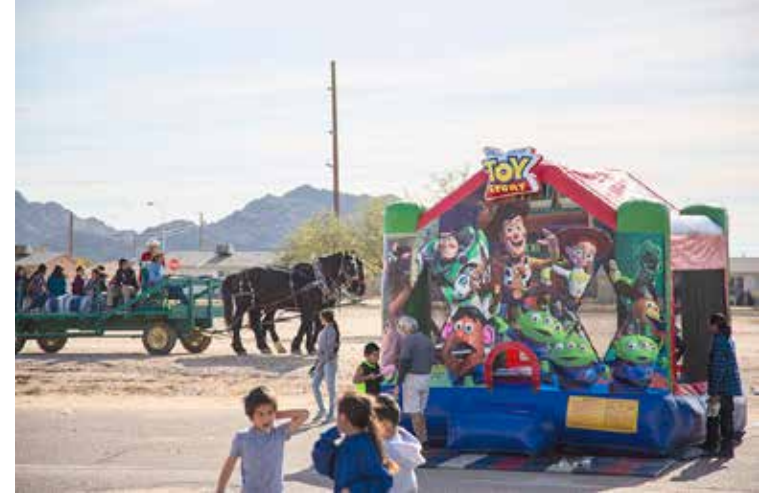
Children made the most of their winter break by celebrating the holidays in District 3.

District 3 held a Christmas event at the Boys & Girls Club of the East Valley, where families enjoyed food, music, inflatable jumpers, gifts for kids and even a wagon ride. District 6 celebrated the season with a "Winter Bash" at Kalka Park. Games, live music, food and gifts brought together plenty of Community members for the event.