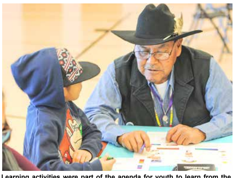
Learning activities were part of the agenda for youth to learn from the elders.

Gila River Indian News P.O. Box 459 Sacaton, AZ 85147 Change Service Requested