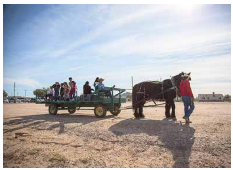
Kids hopped on for some fun wagon rides.