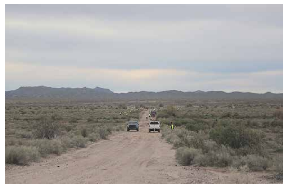
Hunters in pickup trucks disperse during the annual rabbit hunt.