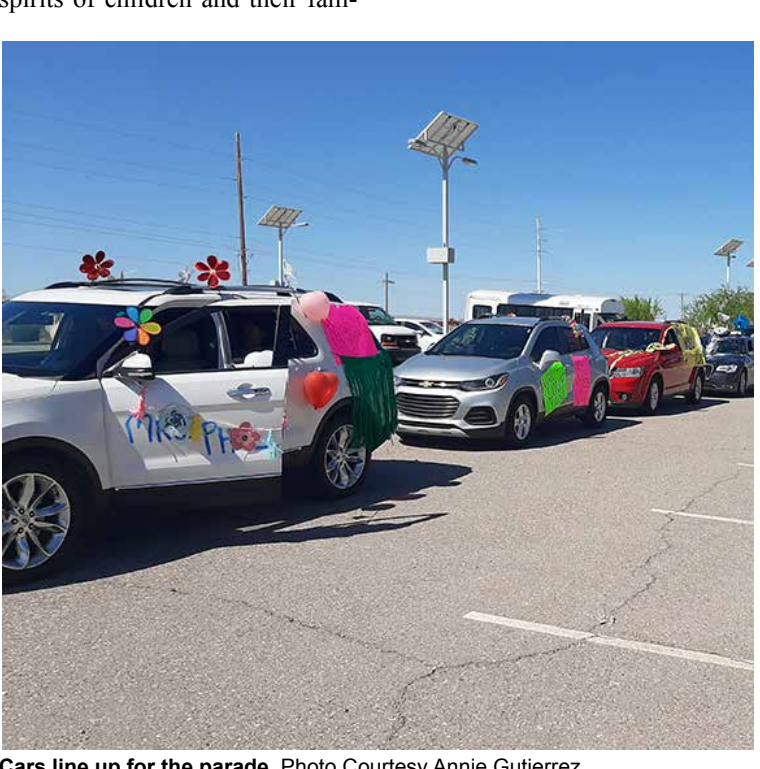
Cars line up for the parade.

much they miss their students and hope to see them back in the classroom soon.