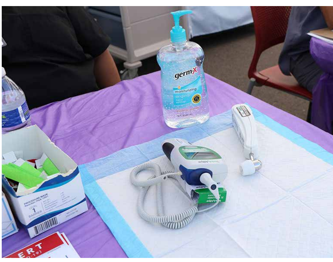
Gila River Health Care screening stations.

Christopher Lomahquahu Gila River Indian News