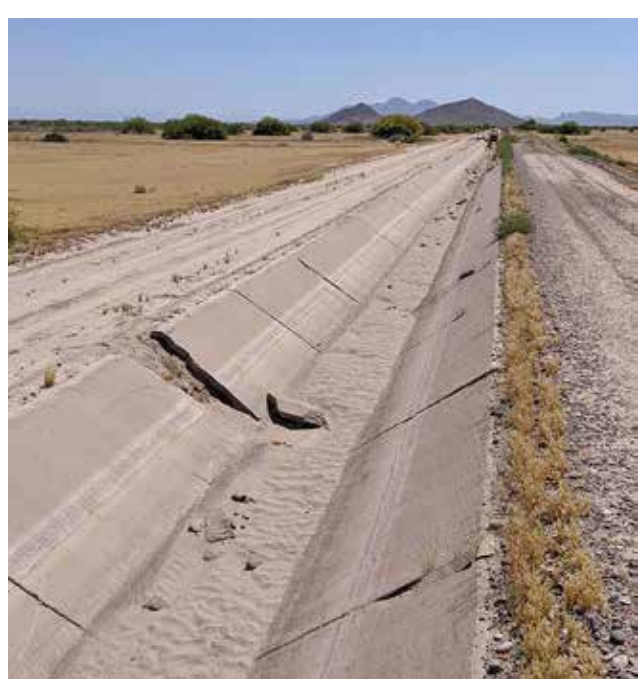
Canal 13-5.6 upstream of Vahki Road. This too will be replaced with a 2' bottom concrete-lined ditch.