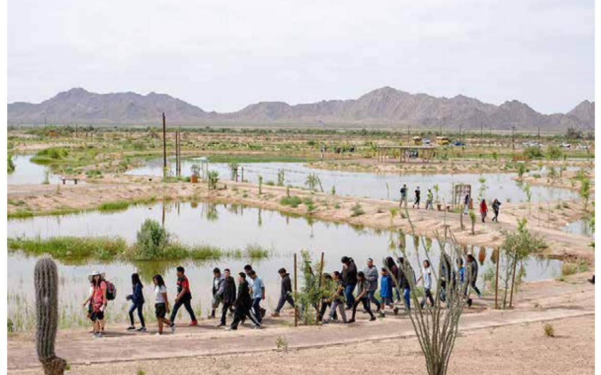
Photograph of MAR-5 featured by Parade Magazine.

You can find the original article by visiting parade. com/1022304/kmccleary/ earth-day-activities/.