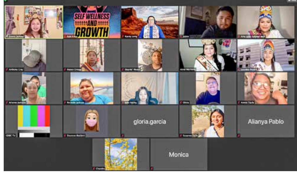
Gila River Royalty wrapped-up a series of virtual workshops focusing on mental health on May 27.