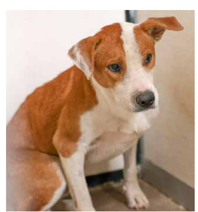
One of many stray dogs available for adoption at the GRIC Animal Control.

"We have been trying to increase the number of our adoptions, but due to COVID, we didn't allow people to come in, and that's one thing that slowed down adoptions," said Yvonne Flores, GRIC Animal Control Supervisor. Today, the facility is back open by appointment only to provide services such as the spay/ neuter and vaccination programs. Animal Control is back to owner turn-ins, investigations, and stray time to view the dogs. dog roundups.