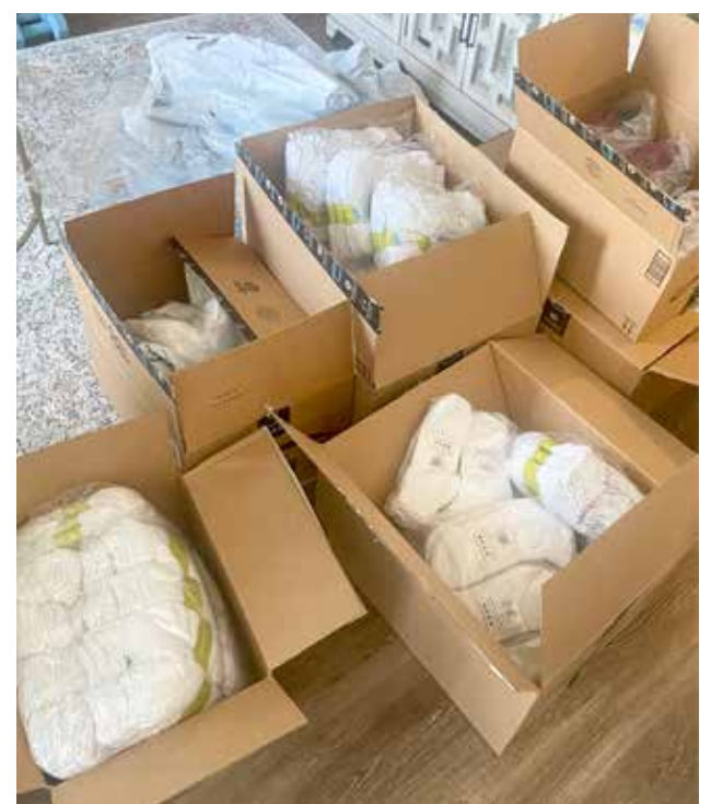
Contributions allowed Danielle Mercado to donate more than 5,000 pairs of socks to Andre House.

When the original goal of 2,000 was met,