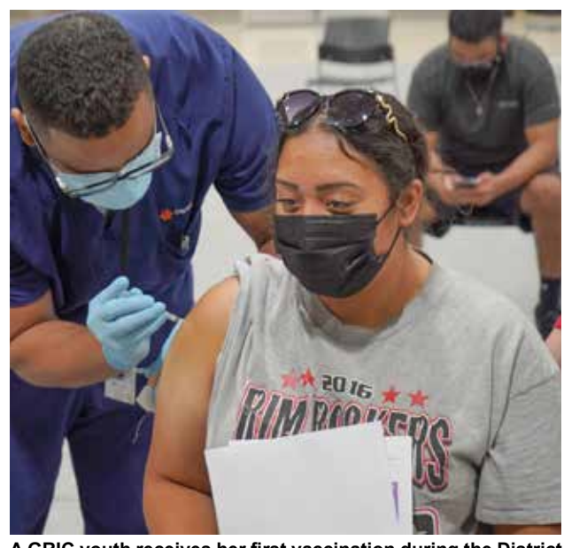
A GRIC youth receives her first vaccination during the District 1 MVU event on Aug. 21.

With the start of school restaurants. just around the corner