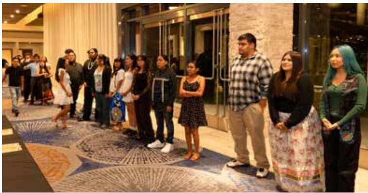
Several graduates attend the 2025 Graduate Recognition Banquet at Gila River Resorts & Casinos - Wild Horse Pass on June 6.