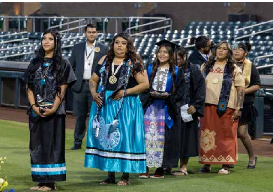
Several graduates are recognized during the American Indian Convocation at Salt River Fields on May 2.

“When I heard the American Indian convocation was being canceled, it was a slap in the face. Later I learned that Salt River is hosting the convocation, I