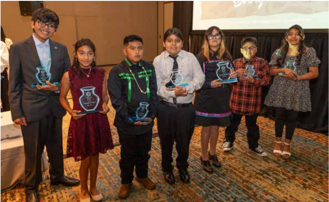
Recipients of the 2025 Chief Antonio Azul Scholar and Citizen Awards.