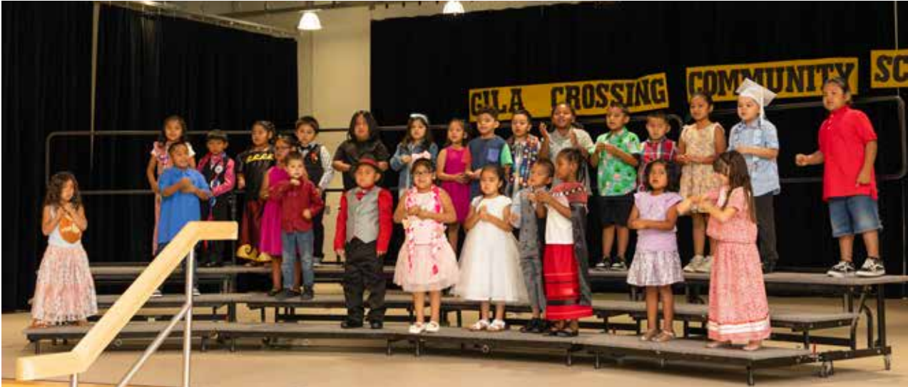
Kindergarten students perform a graduation song and dance.