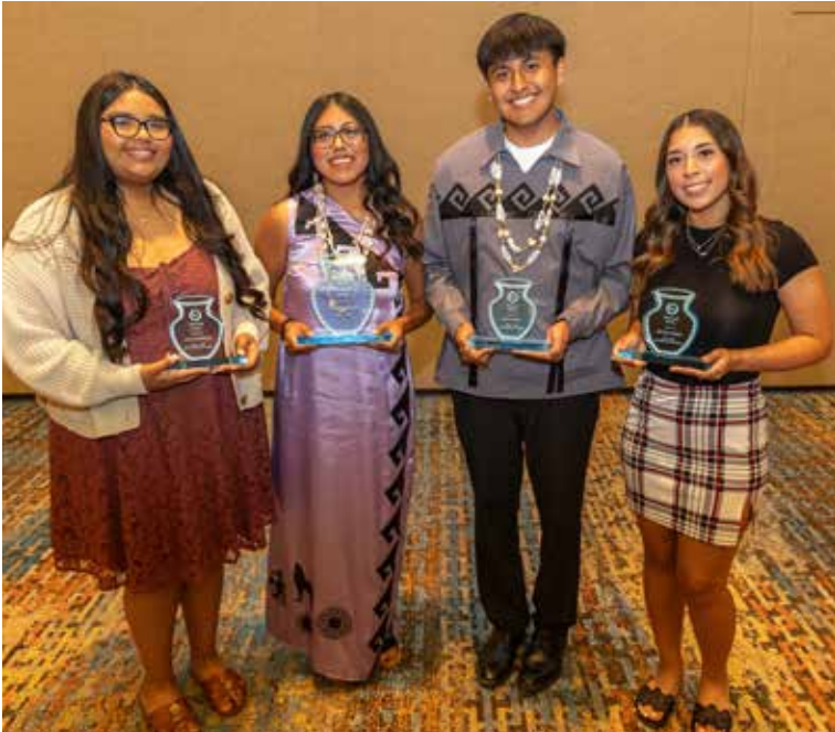
Recipients of the 2025 Chief Antonio Azul Scholar and Citizen Awards.