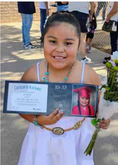
Ivy Ramirez Dos Rios Elementary