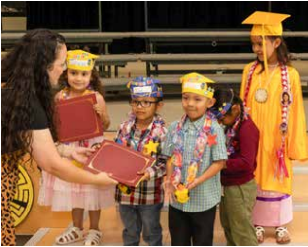
Pre-K students promote on May 29.