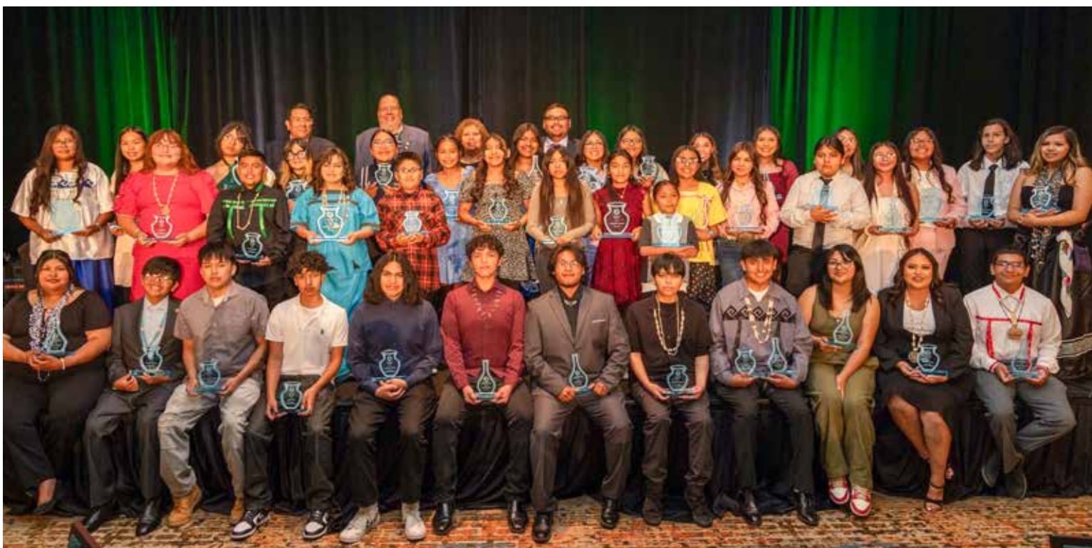
2025 Chief Azul Scholar and Citizen Awardees during the banquet on May 9.