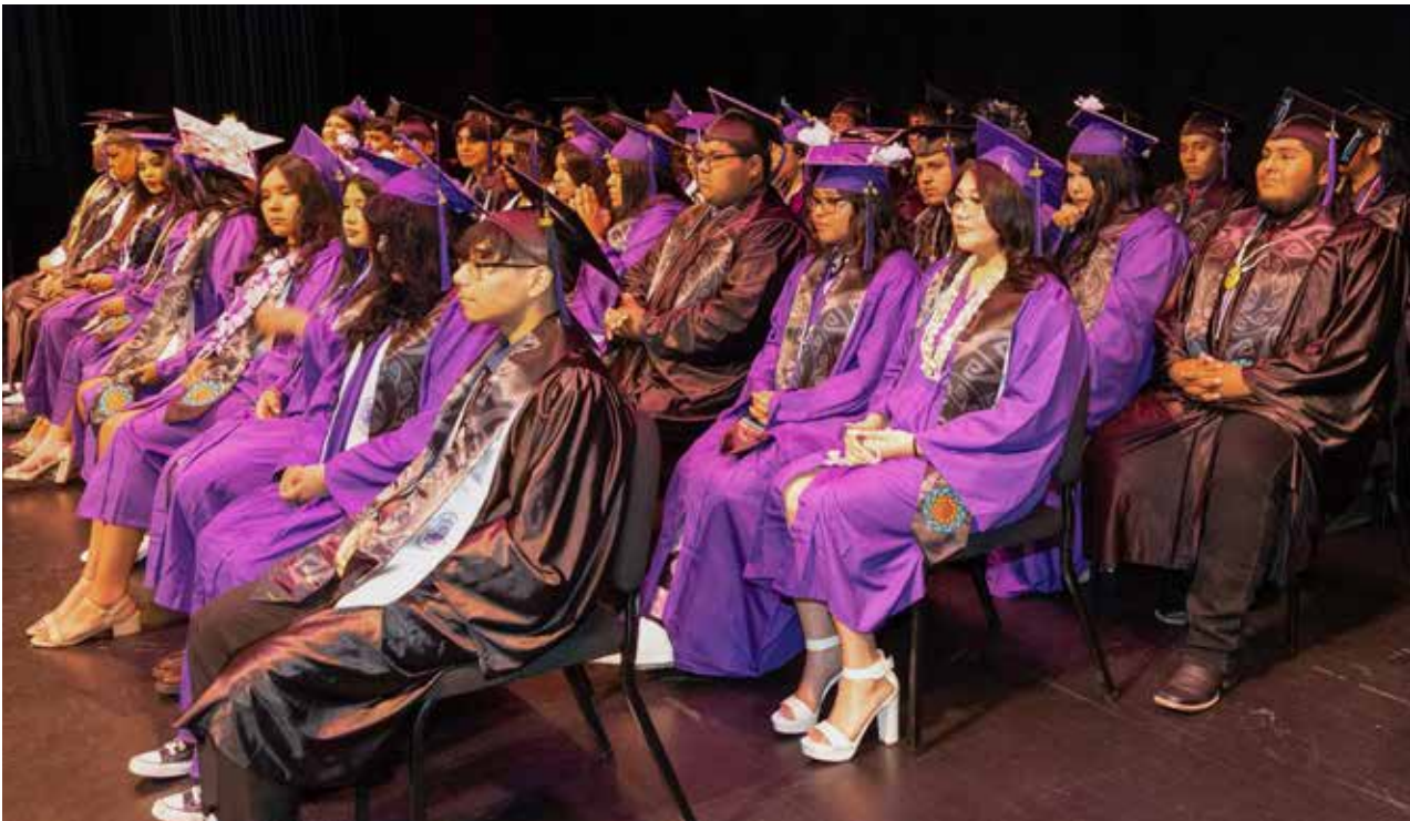
Skyline Gila River Students during their graduation ceremony at the Mesa Arts Center on May 8.