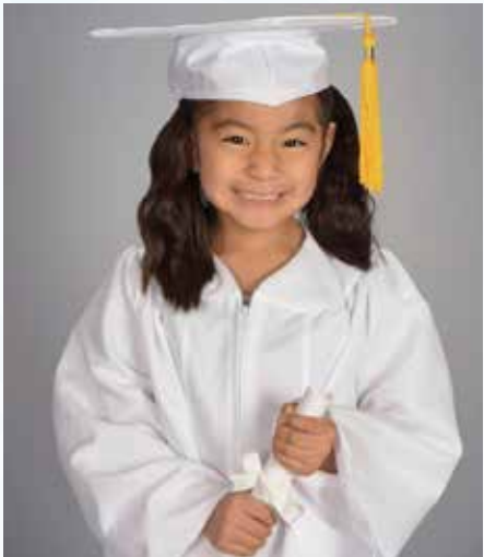
Amira Thomas Early Education Child Care