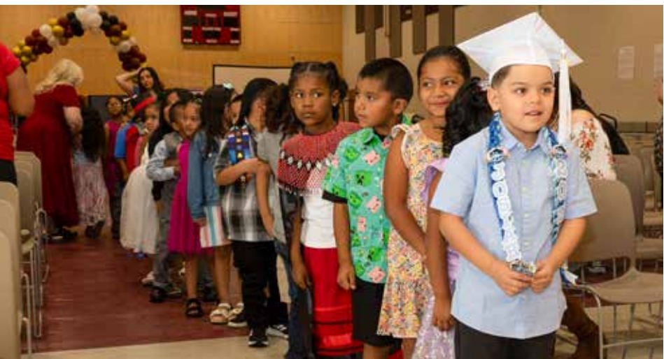
26 students promote from kindergarten on May 29.

sang their promotion song. The parents applauded and cheered on the students. Acosta presented each student with their promotion certificate. The pre-kindergarten class posed with a