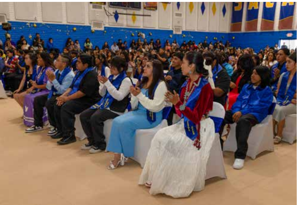
Students promote from Sacaton Middle School on May 21.