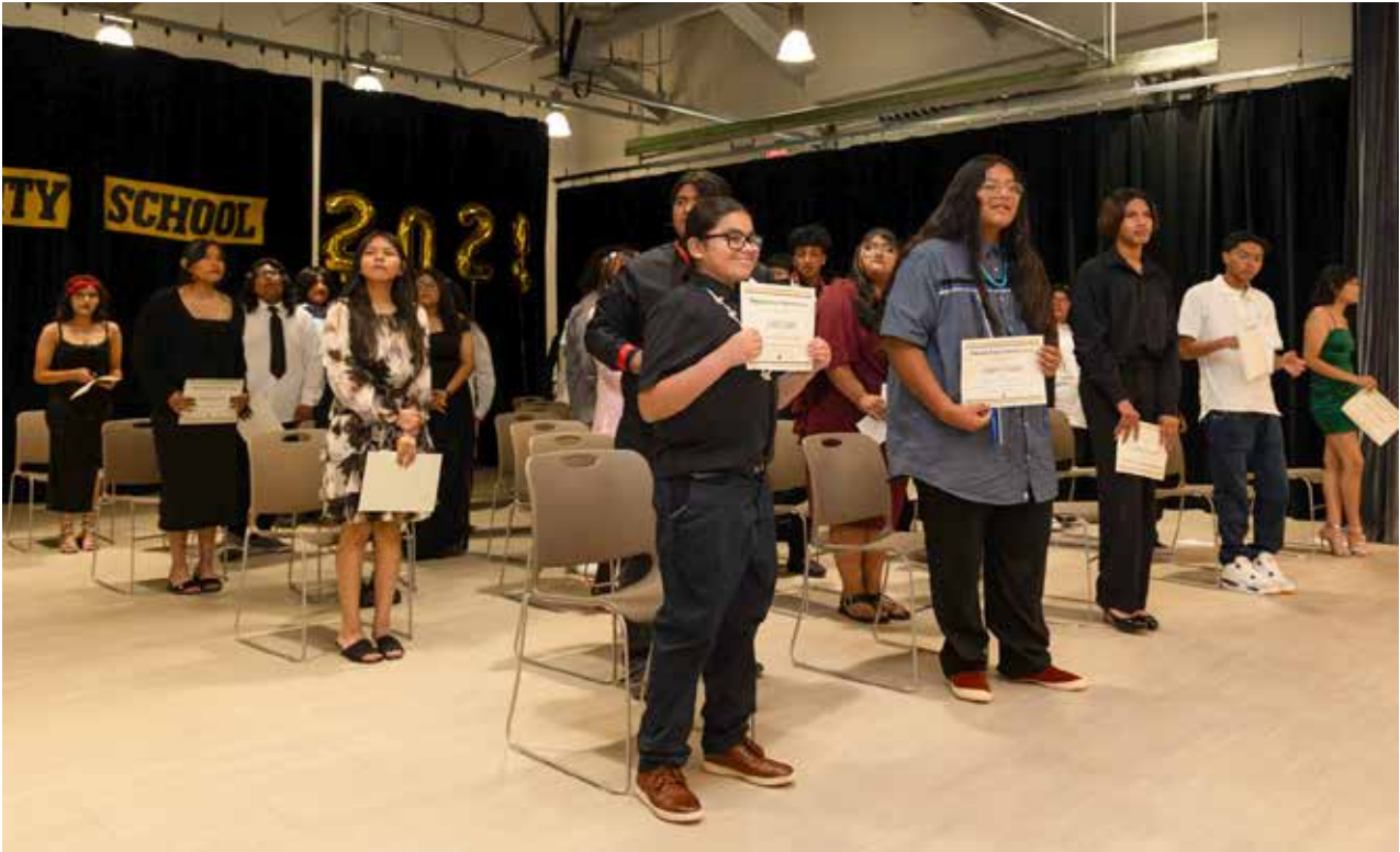
Eighth grade promotion at the Gila Crossing Community School on May 28.