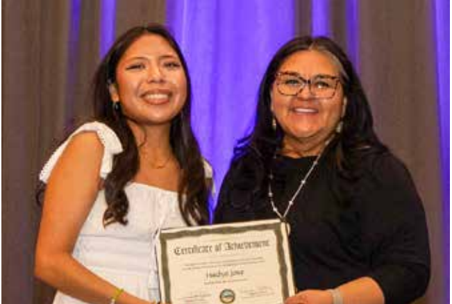
Gila River Indian Community graduates are recognized during a banquet hosted by the Tribal Education Department.