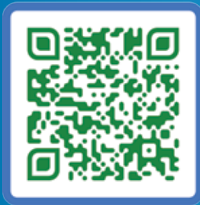
BHS Service Guide

Scan the QR Code to visit GRHC.ORG/BHS for a complete list of Behavioral Health Services including: