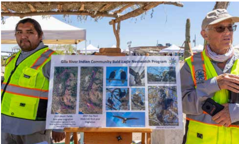
Department of Environmental staff providing information on the Community’s Bald Eagle Nestwatch program.