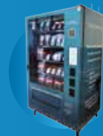
Health & Safety Vending Machine