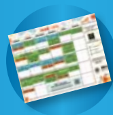
Calendar of Events