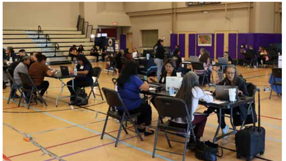
Members are receiving consultation at the probate station.