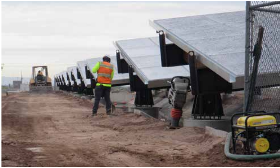
Solar panels are installed over the canal along State Route 87 on April 1.

Drivers traveling along State Route 87 in the Gila River Indian Community will notice a new stretch of solar panels being installed over a major irrigation canal, a significant step toward expanding clean energy and conserving water. The project focuses on sustainable infrastructure and long-term stewardship of Community resources.