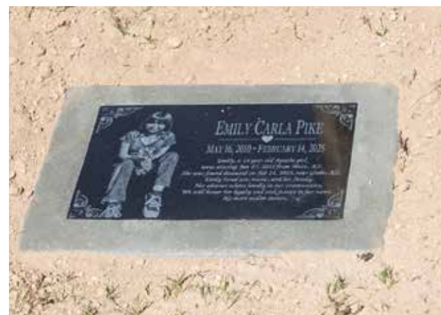
A granite plaque was installed at Fitch Park in Mesa for Emily Pike on March 3.

ic across the nation. The public is encouraged to organize future days of remembrance of Emily at the park following proper city requests and permits.