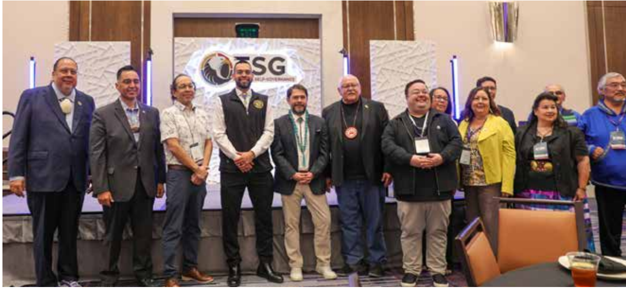
Tribal leaders and federal partners from across the country gathered at Wild Horse Pass for the 2026 Tribal Self-Governance Conference on April 7-9.

This year's theme, "Next Gen of Tribal Self-Governance: Turning Change into Opportunity," reflected a forward-looking agenda. Sessions focused on emerging technologies, federal policy shifts, and the evolving responsibilities Tribal Nations are taking on as they assume greater control over programs once managed by