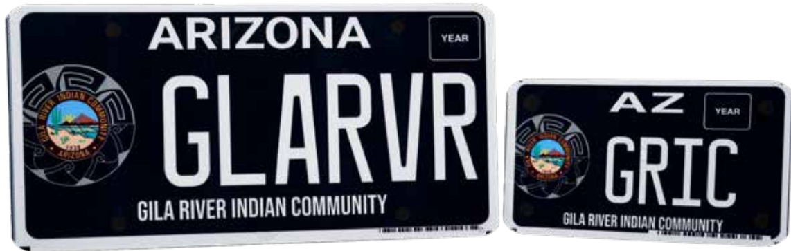
Gila River Indian Community’s specialty license plate is now available for purchase.

The specialty plate is now available for purchase through the Arizona Motor Vehicle Division website: azmvdnow.gov/plates . It is available to anyone in the state and is also offered as a motorcycle plate. It cost $25 for the specialty plate and an additional $25 for personalization. $17 goes to the GRIC for traffic-controlled devices.