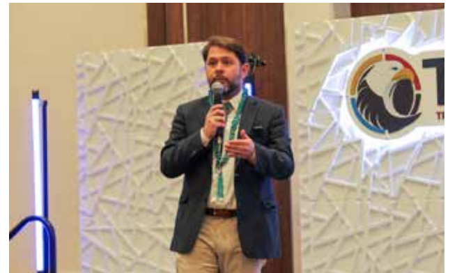
Senator Ruben Gallego was presented with a necklace by Navajo Nation veterans.

For Gila River, the conference reaffirmed something essential: that the Community is not only a host, but a leader in the national movement for Tribal self-governance. And for all who attended, it was a reminder that sovereignty is strongest when it is shared, discussed, challenged, and renewed together.