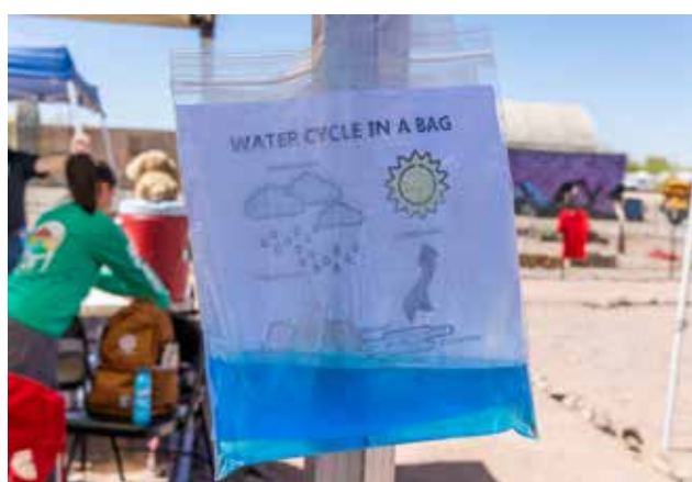
One of the informational booths featured an activity to learn more about the water cycle.

Hands-on activities were a highlight of the event, giving attendees the opportunity to get involved directly. From planting demonstrations to interactive crafts using recycled materials, participants were able to learn by doing.