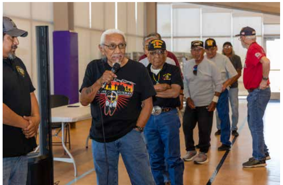
Vietnam Veterans introduce themselves during the event on March 30.